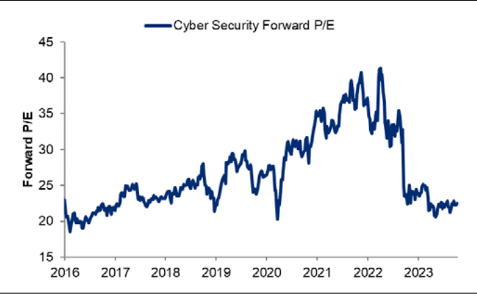
Figure 6: Cyber Security Forward P/E

The Cyber Security proxy is the Nasdaq Cybersecurity Index. Indices are unmanaged. An investor cannot invest directly in an index. They are shown for illustrative purposes only and do not represent the performance of any specific investment. Index returns do not include any expenses, fees or sales charges, which would lower performance. All forecasts are expressions of opinion and are subject to change without notice and are not intended to be a guarantee of future events. Past performance is no guarantee of future results. Real results may vary.