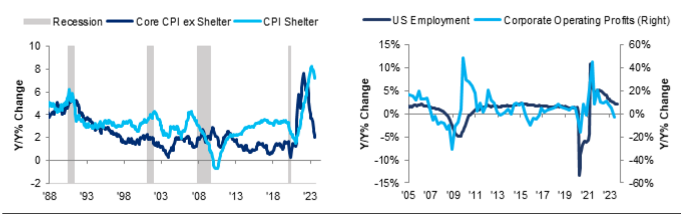
Figure 3 US National Corporate Profits and Employment

Indices are unmanaged. An investor cannot invest directly in an index. They are shown for illustrative purposes only and do not represent the performance of any specific investment. Index returns do not include any expenses, fees or sales charges, which would lower performance.. All forecasts are expressions of opinion and are subject to change without notice and are not intended to be a guarantee of future events. Past performance is no guarantee of future results. Real results may vary.