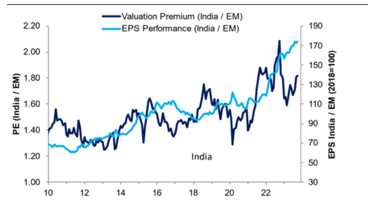
Figure 5: MSCI India/EM Relative Valuation and EPS

Indices are unmanaged. An investor cannot invest directly in an index. They are shown for illustrative purposes only and do not represent the performance of any specific investment. Index returns do not include any expenses, fees or sales charges, which would lower performance. All forecasts are expressions of opinion and are subject to change without notice and are not intended to be a guarantee of future events. Past performance is no guarantee of future results. Real results may vary.